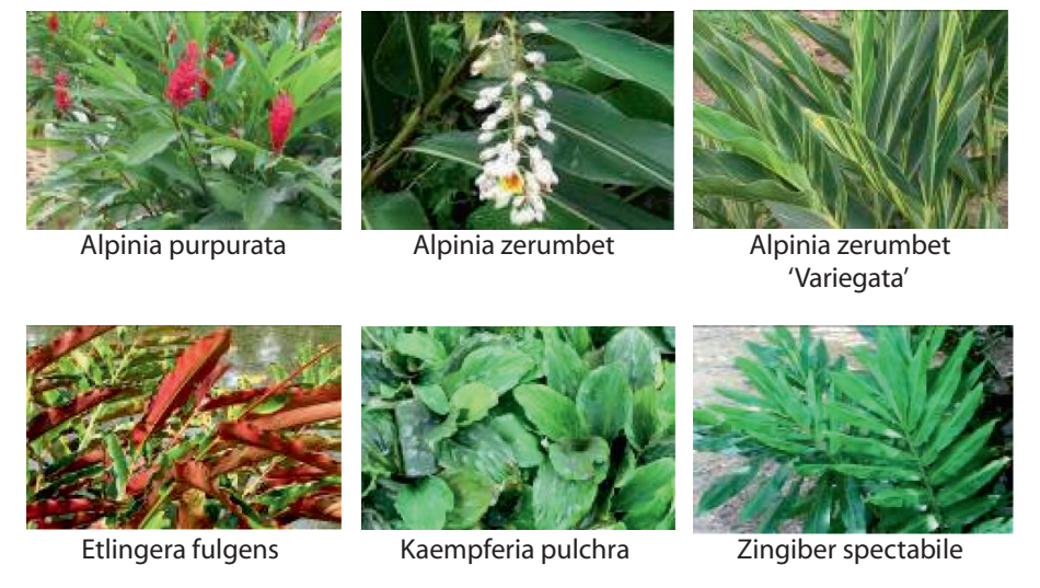
Figure 2. Some ornamental ginger species.